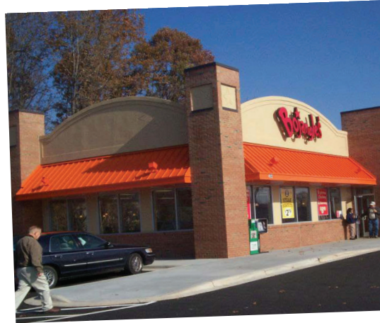
Fast Food Restaurant

All of our work is reviewed by an independent CPA.